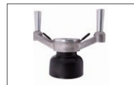
Premium Quick Nut