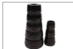
Double Sided Collets