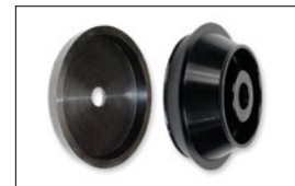
Light Truck Cone Kit