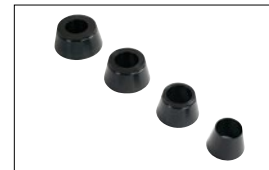
Tweener Cone Kit